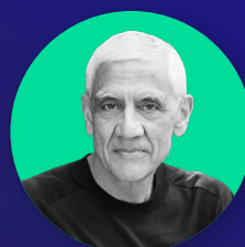
Vinod Kohsla Partner Kohsla Ventures