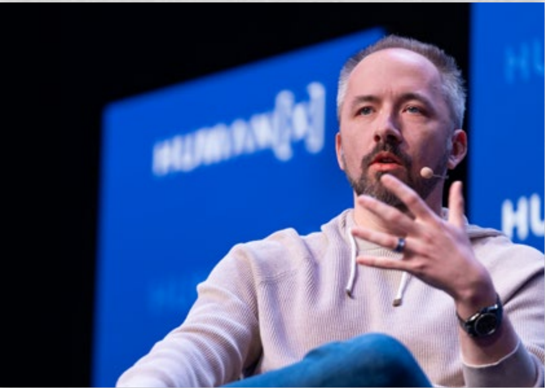
Drew Houston, Co-founder & CEO, Dropbox