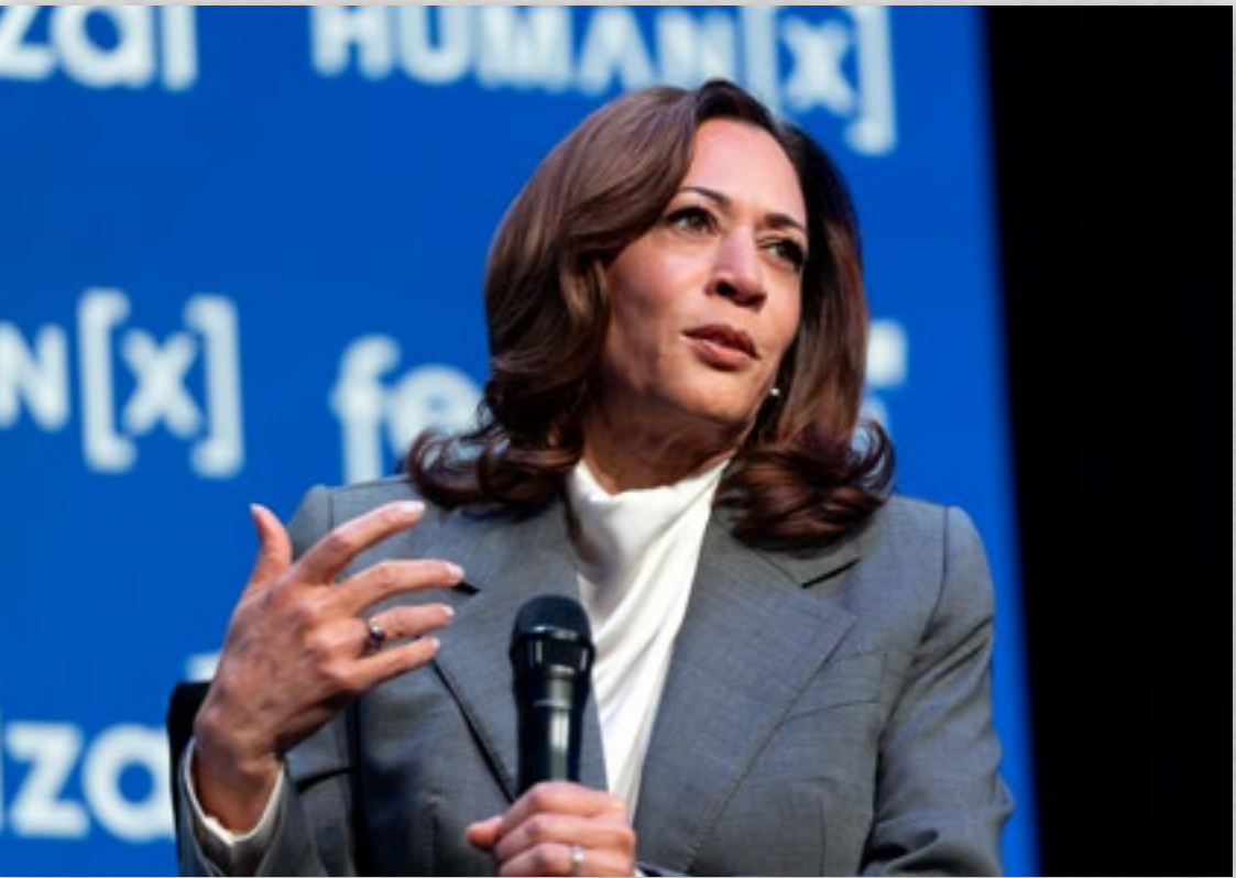
Kamala Harris, 49th VP of the United States